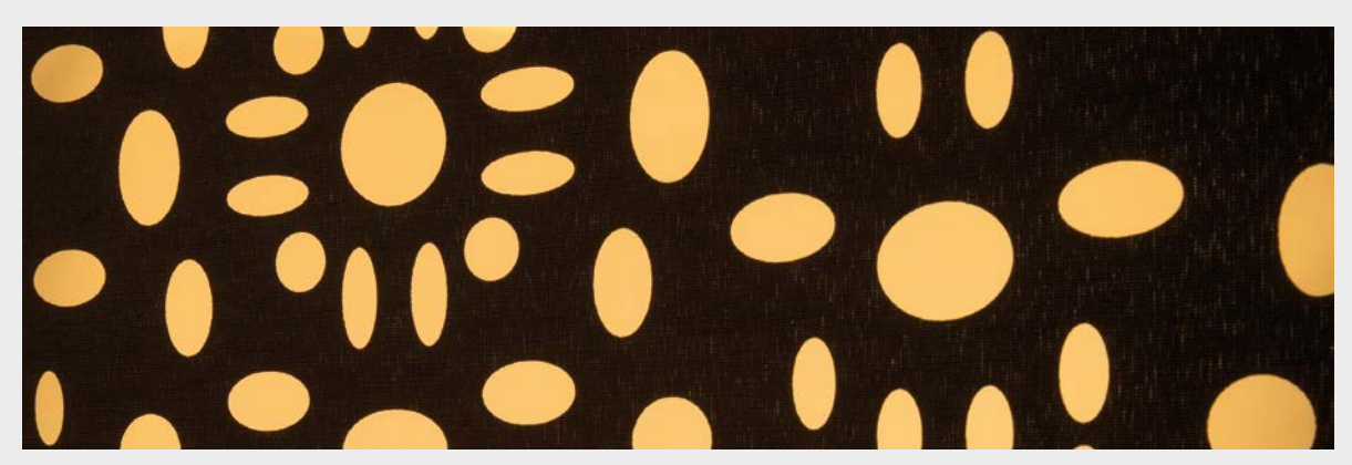
The cutting-out of individual designs is possible with fabrics from our Silent Gliss collections.