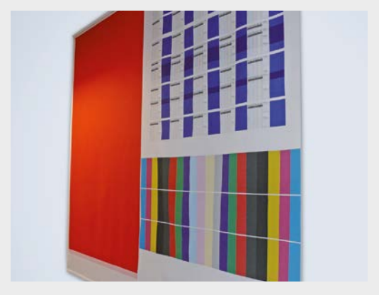
Holohedral printing — Fabrics can be printed over the entire surface with any kind of Pantone colour!