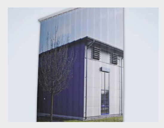
Vertical Blind louvres are suitable for digital printing as well.