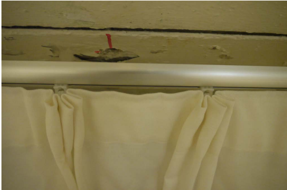
Figure B.1. Curtain track system rail with curtain fabric in folded arrangement.