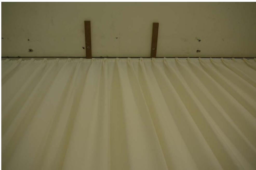
Figure B.2. Test object mounted in the reverberation room.