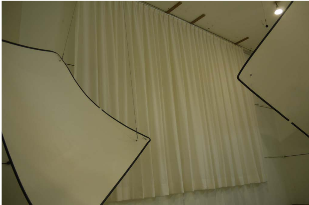
Figure B.3. Test object mounted in the reverberation room.